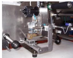
date / lot no. printer