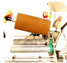
Lift roller / trigger